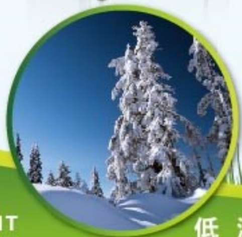
低溫 Low temperature