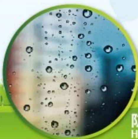
防潮 Humidity Isolation