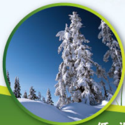
低溫 Low temperature