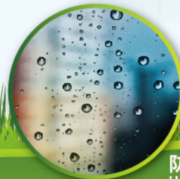
防潮 Humidity Isolation